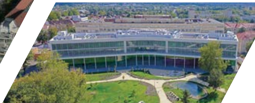
← Faculty of Humanities and Social Sciences and Faculty of Sciences