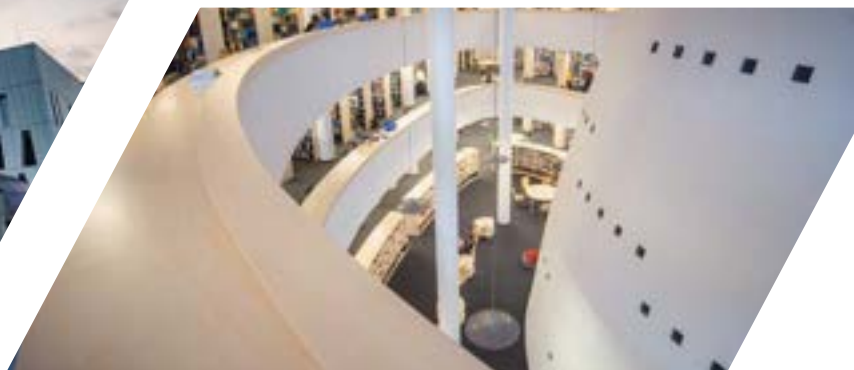
← Szentágothai Research Centre